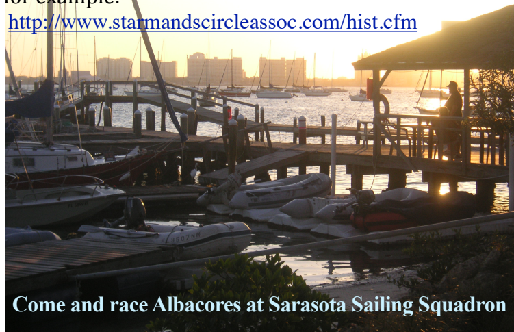
Come and race Albacores at Sarasota Sailing Squadron